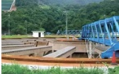
Tanks, Silos and Chimneys